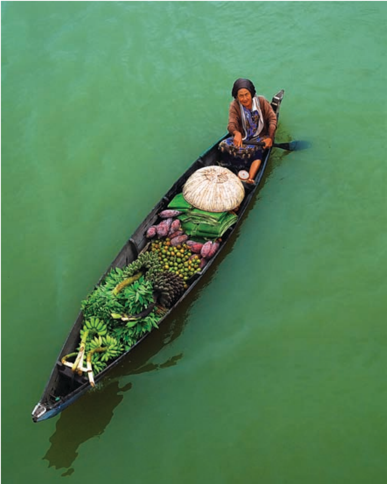
6 FLOATING MARKET BY TONI KUSNANDAR