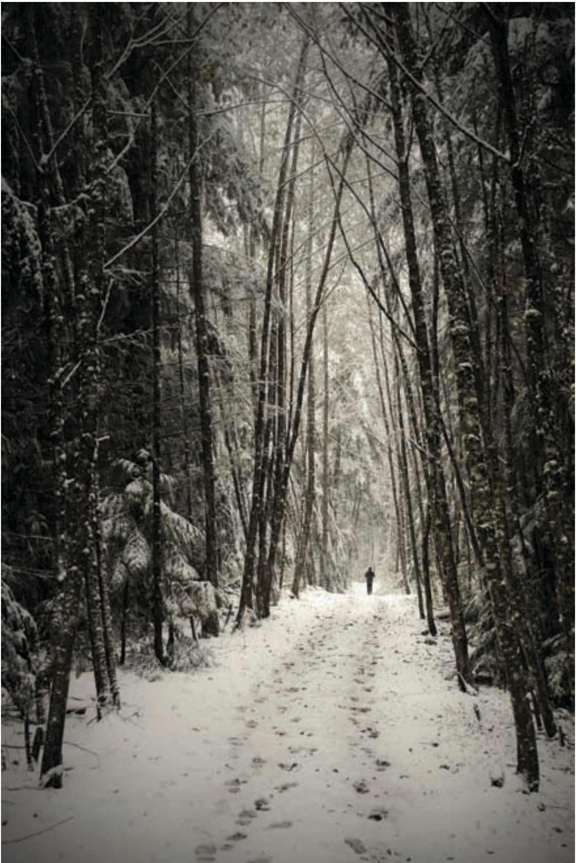
IRA LAKE TRAIL BY KI KOPKAU 9