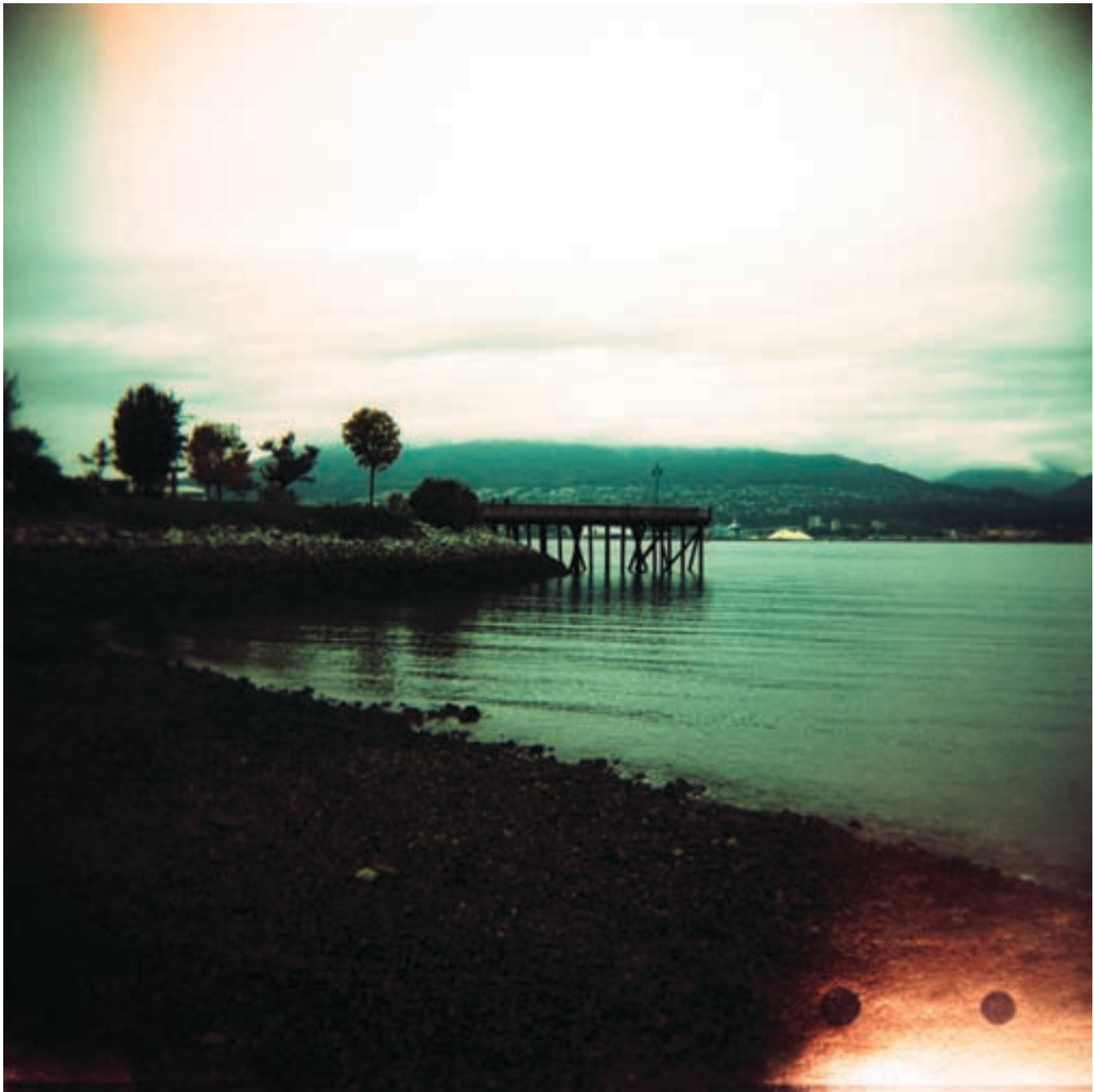
PLASTIC UNTITLED 38 BY MR T. 7