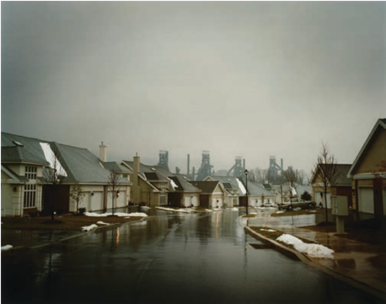
8 VILLAGE DRIVE BETHLEHEM, PENNSYLVANIA BY NICOLE LLOYD