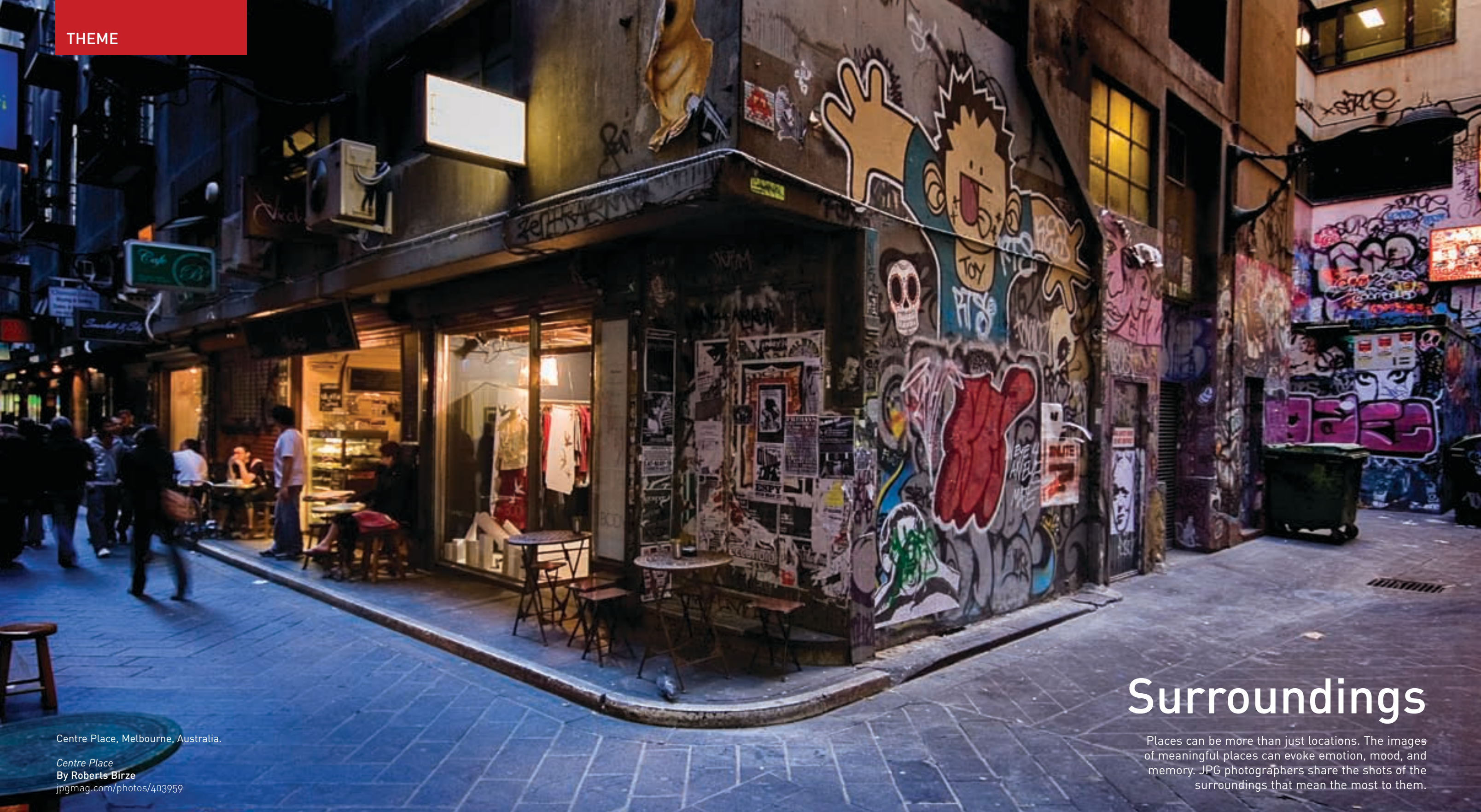
Centre Place, Melbourne, Australia.