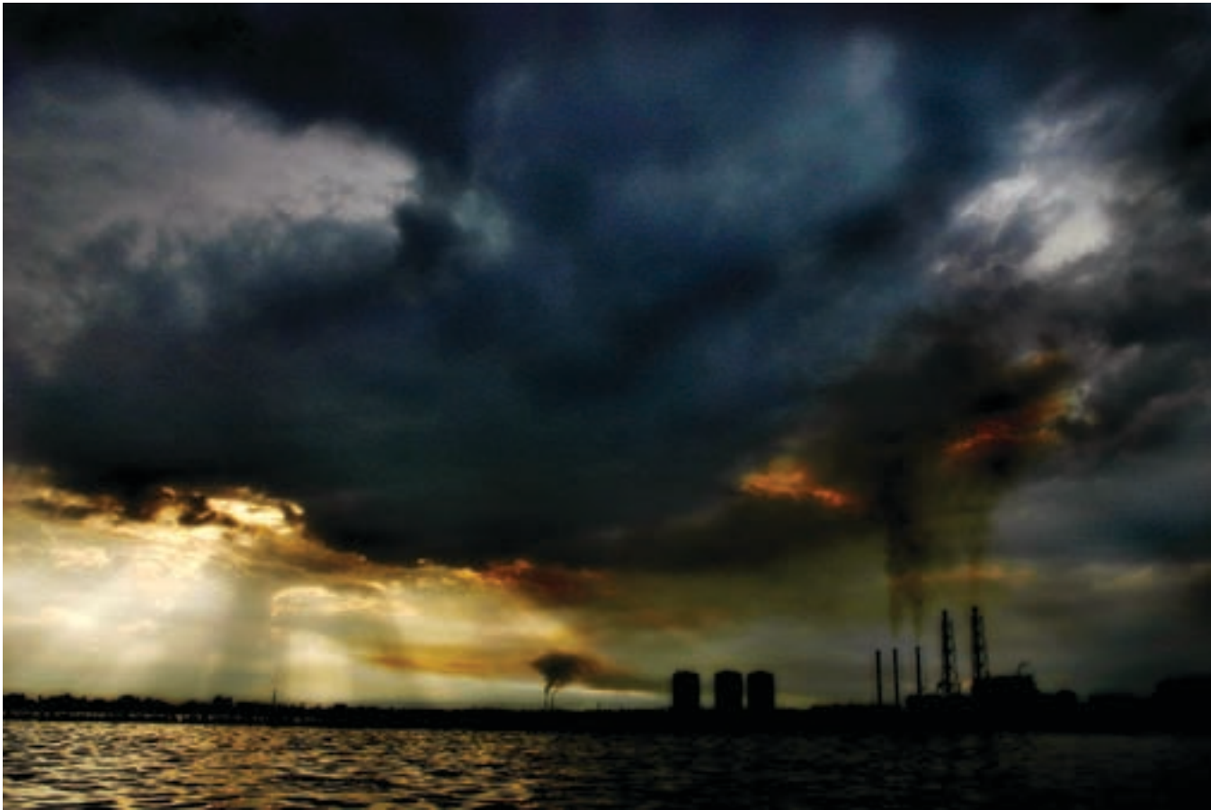
2 MORNING VIEW OF JAKARTA BY ARWAN MAURIATTAMA