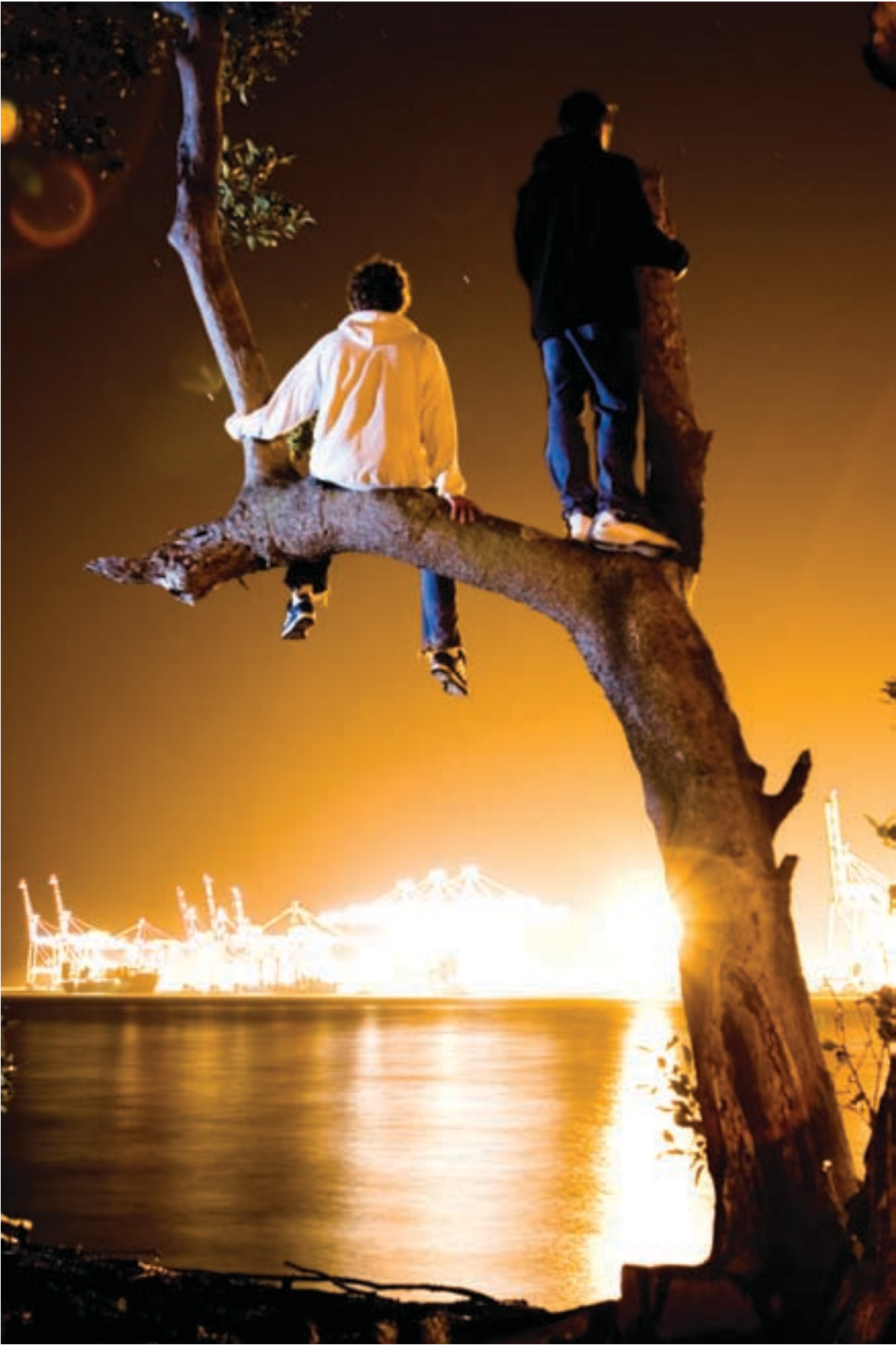
6 THE PORT OF BRISBANE BY CONAN WHITEHOUSE