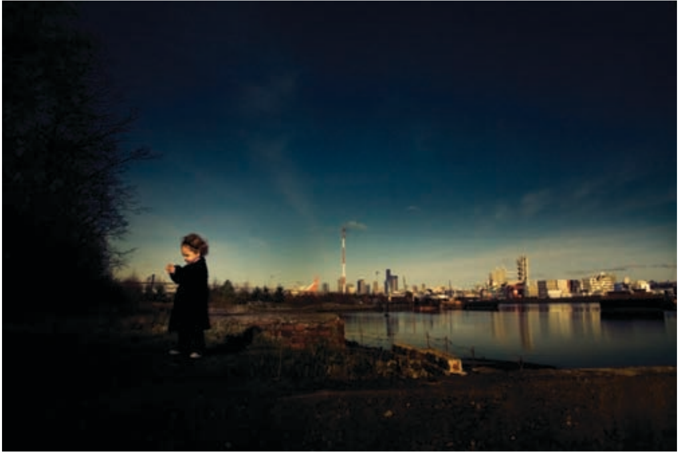
T-107 ALONG THE DUWAMISH BY JEFF BLUCHER 7