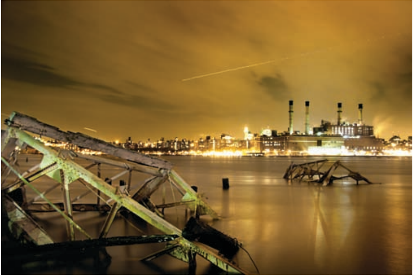
BROOKLYN APOCALYPSE BY STEPH GORALNICK 23