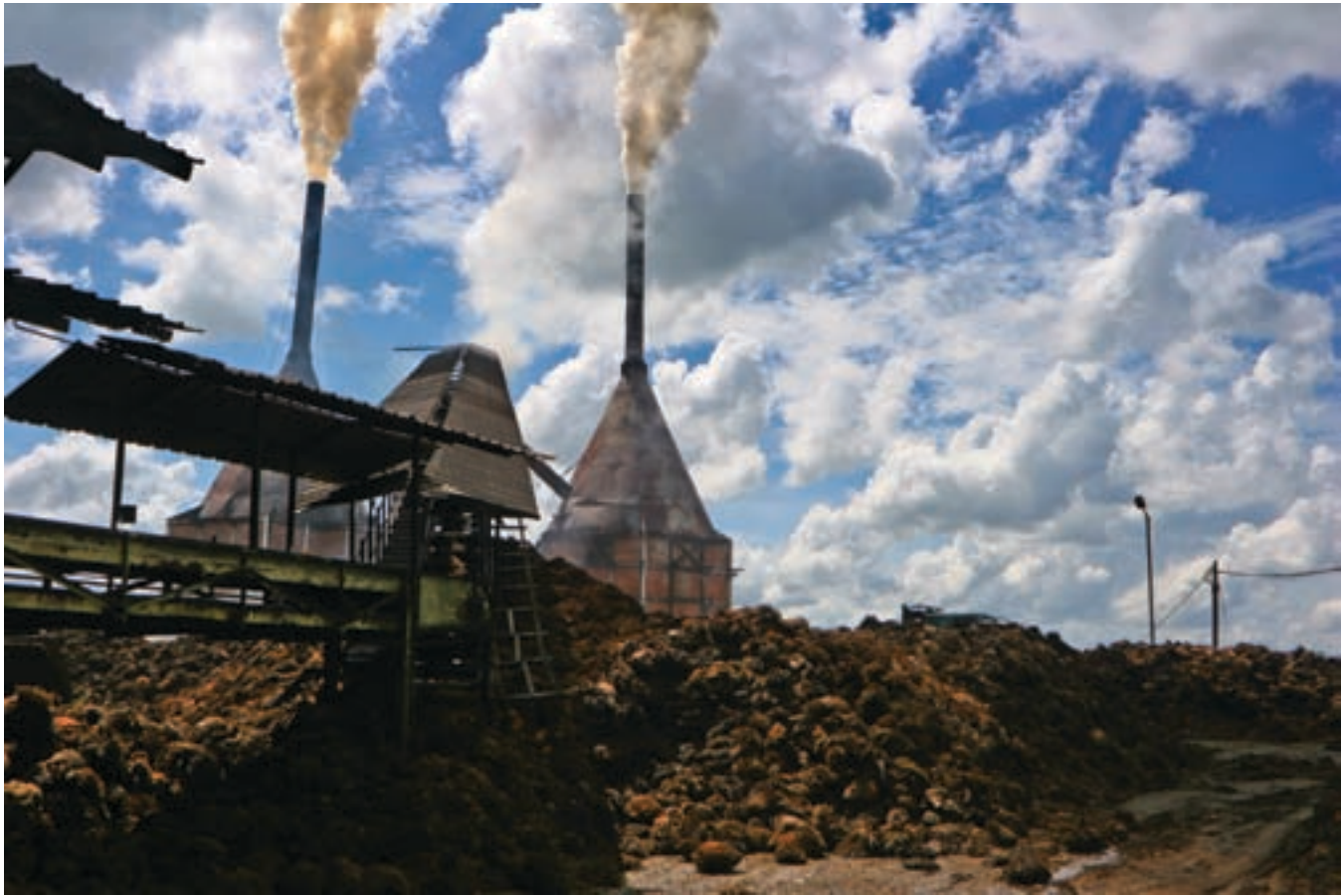
WASTE BY BRIAN HUTCHINSON 3