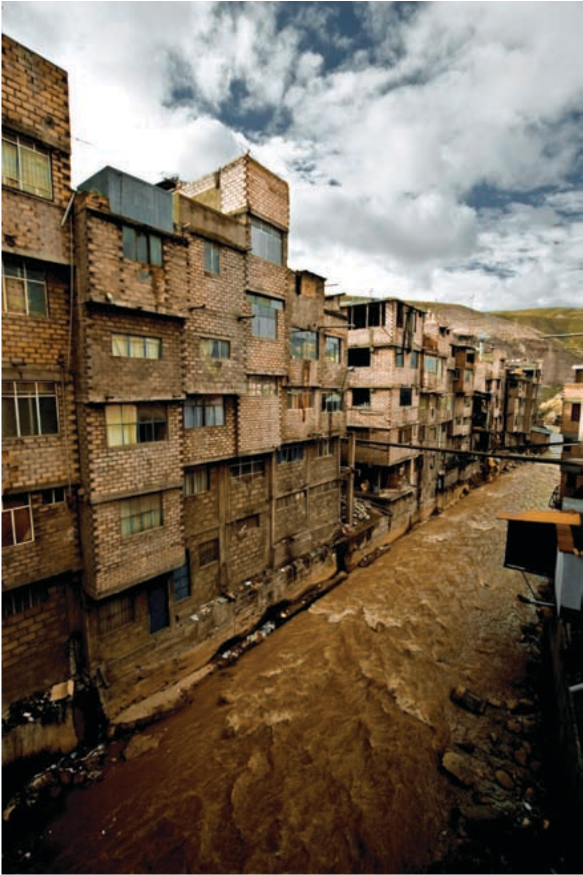
22 PERUVIAN VENICE BY ERASMO WONG