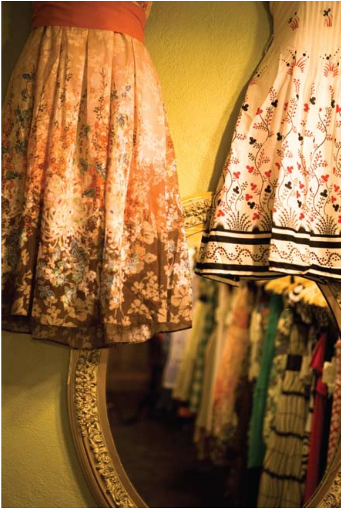
12 MIRROR MIRROR BY JUSTIN VANALSTYNE