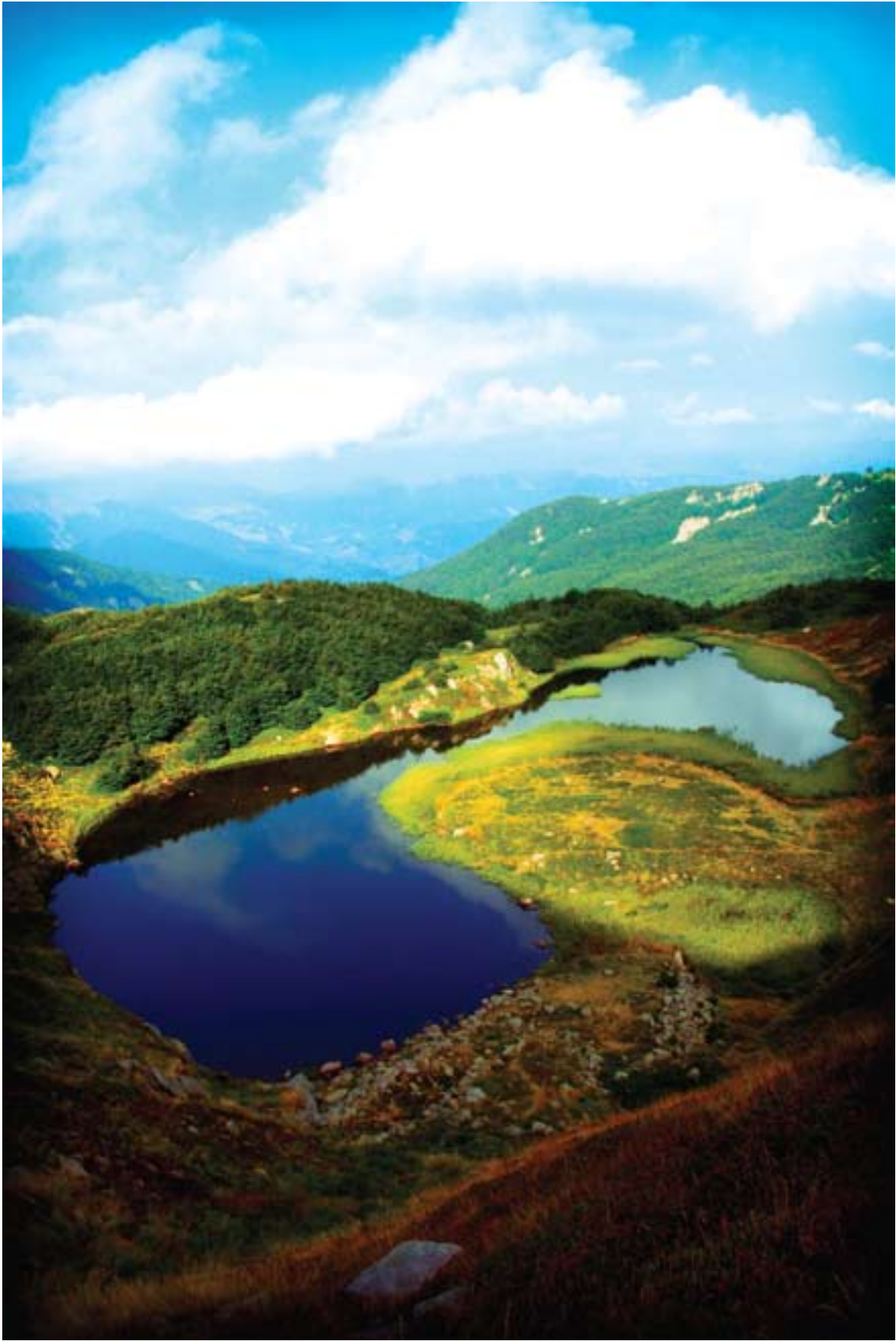
4 DEAD LAKE BY ALESSANDRO TABACCHI