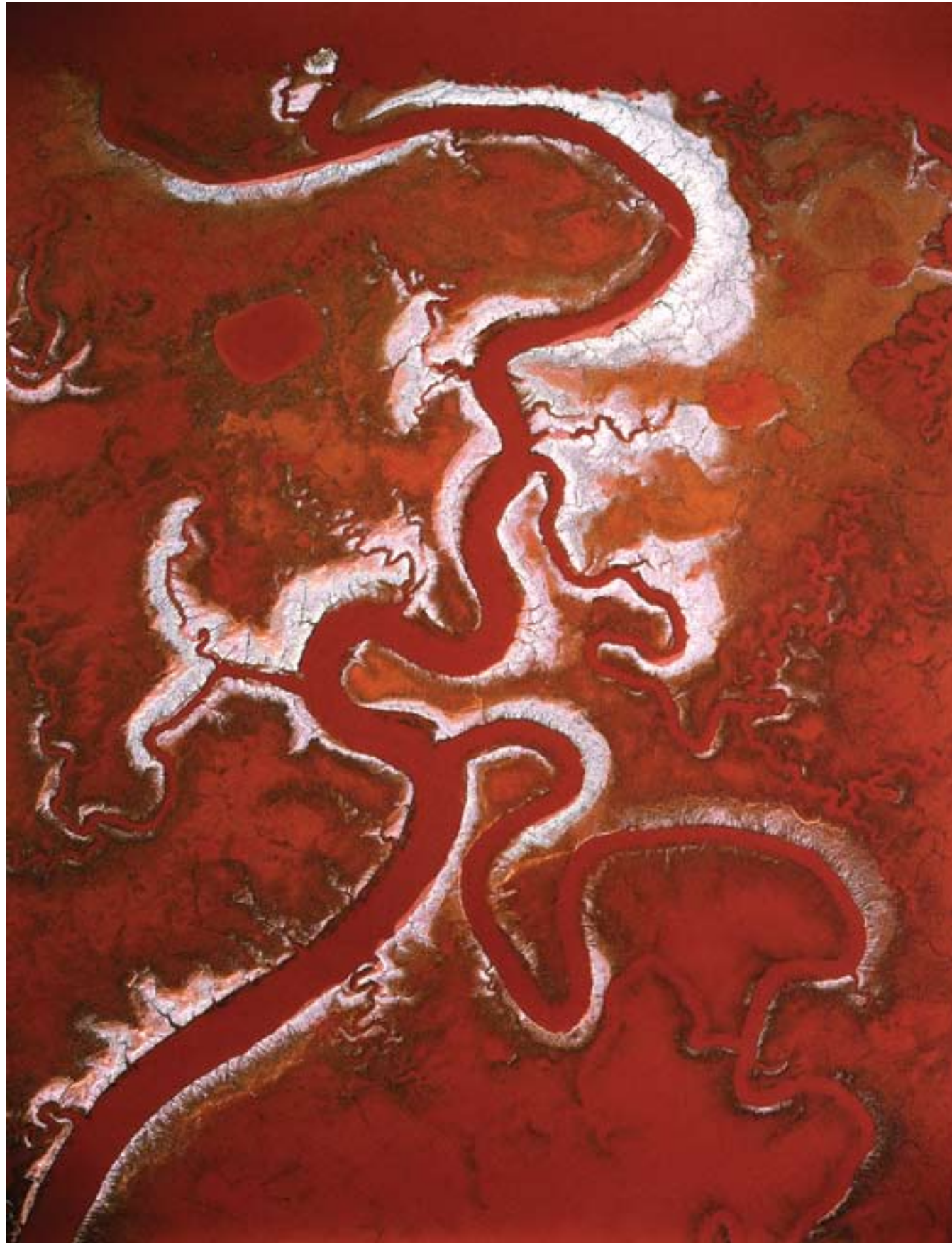
10 RED DRAGON SALT EVAPORATION POND AERIAL BY DAN DARROCH