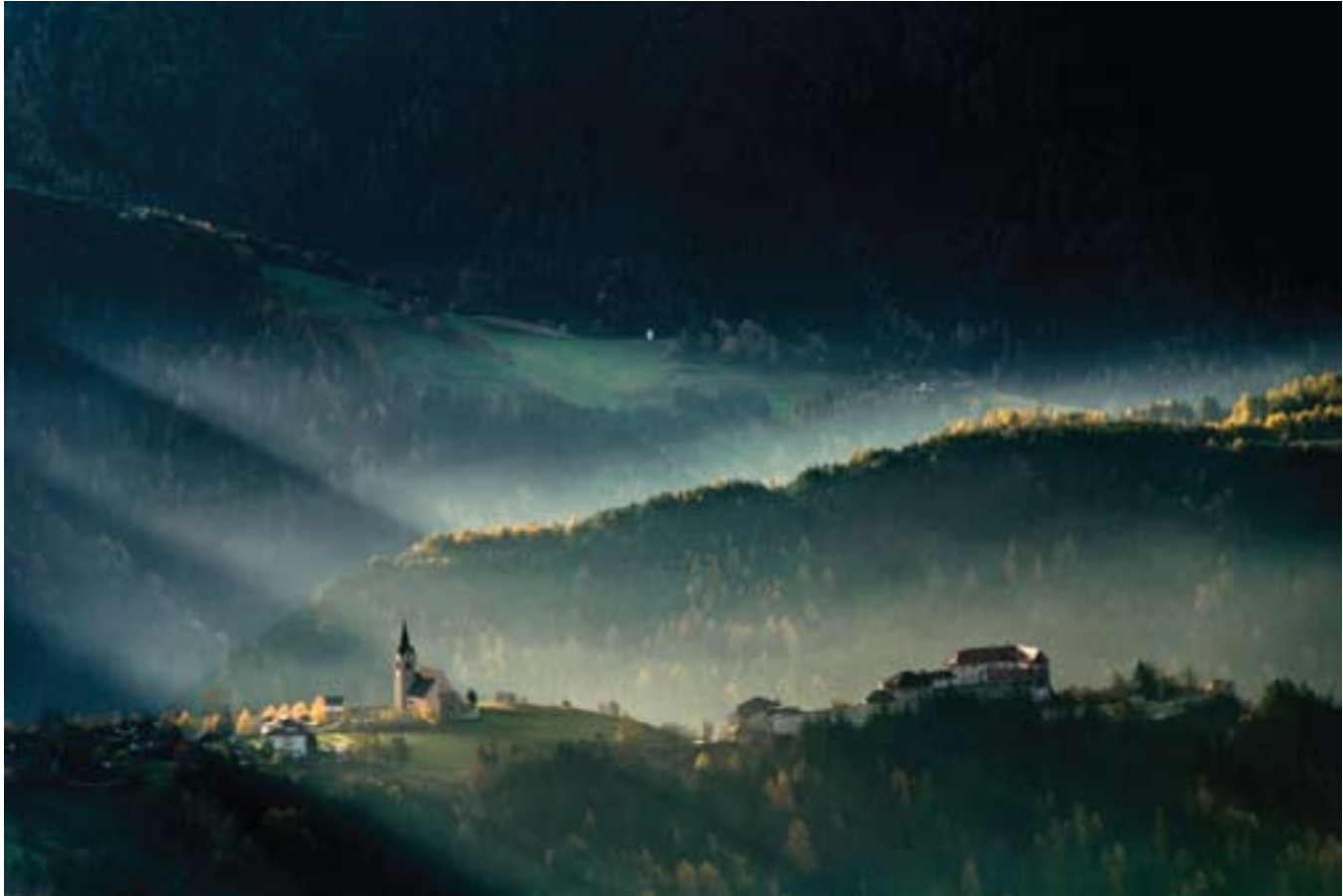
MORNING LIGHT BY ALFRED PLEYER 5