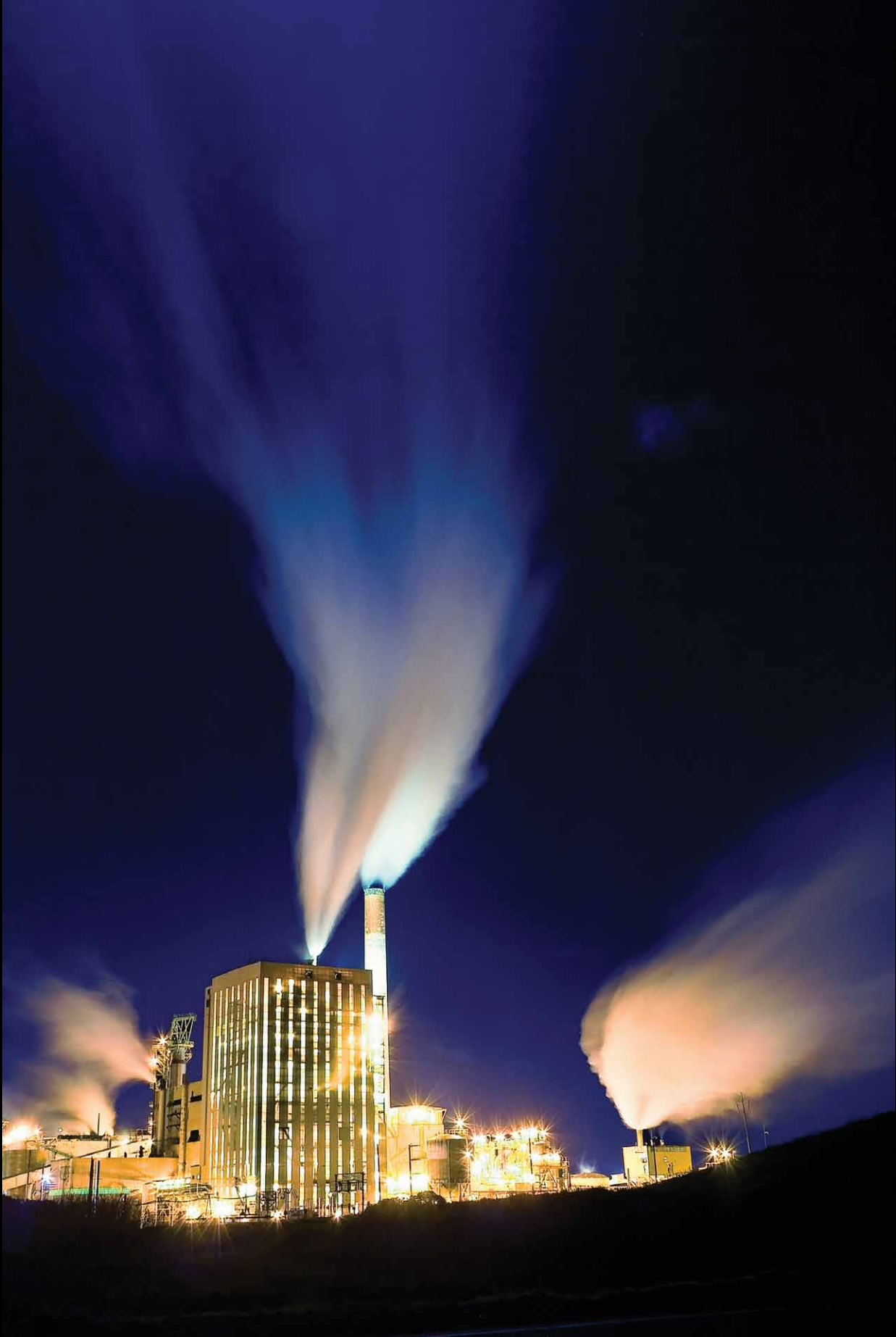
4 PULP MILL BY JORIN BUKOSKY