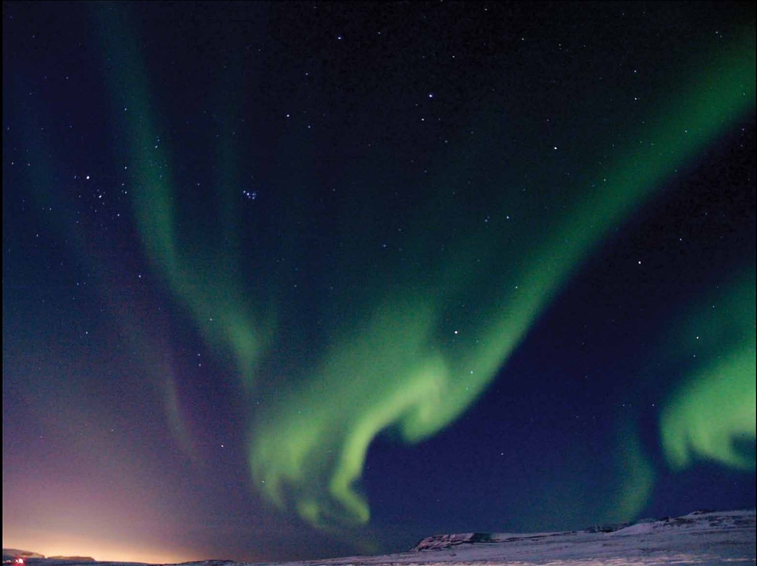
NORTHEN LIGHTS BY CHRIS BYRNE 5