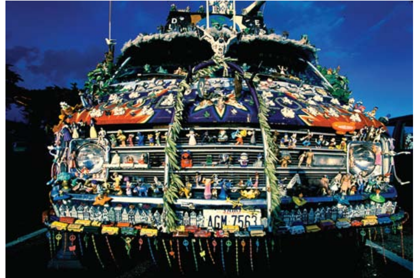
ART CAR BY DAN DARROCH 19