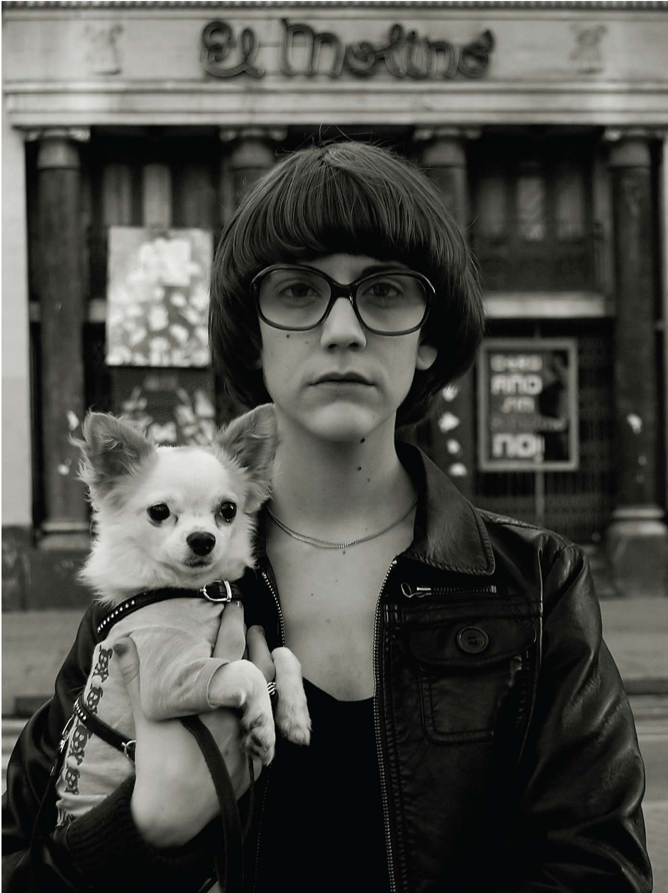
10 GIRL IN FRONT OF “LE PETIT MOULIN ROUGE” BY FRANCISCO UBEDA LLORENTE